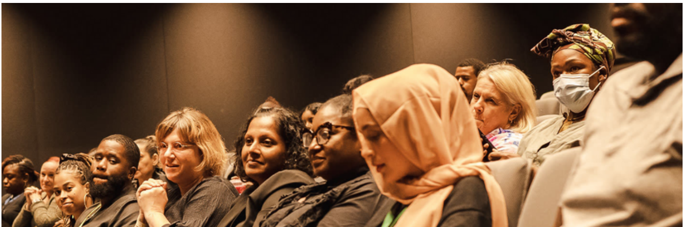
The audience at Invisible Wounds – Film Screening & Panel Discussion - Innis Town Hall Theatre, Sept. 13/22